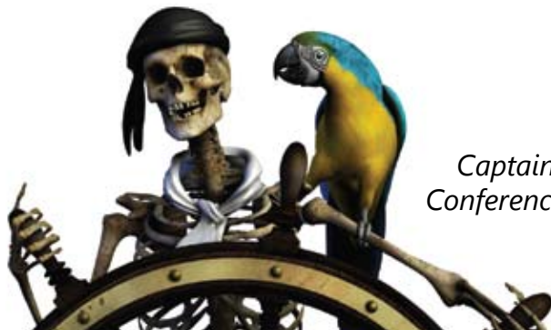
Captain Jack Conference Guide