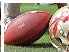
Pictured above: Waldorf-Astoria Naples stay & spa package; SeaWorld tickets; The Breakers 2-night stay; and a signed FSU football.

Other fun Foundation favorites going on in the Silent Auction include the Wine & Liquor Toss and the chance to win one of four amazing packages with the purchase of BIG Tickets.